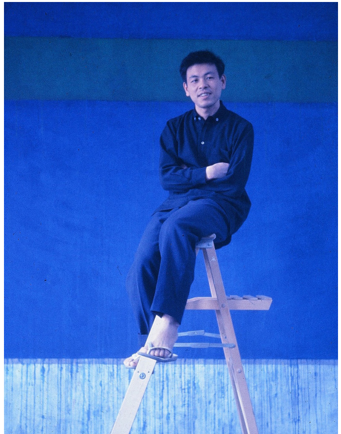
Tadaaki Kuwayama at his studio on 6th Avenue, New York, 1959.

In the early 1960s, shortly after his arrival in New York, Kuwayama produced paintings that were made by applying Japanese mineral pigments and acrylic solvent on boards wrapped in Japanese paper—perhaps inspired by his prior training. Some were completely monochrome, and others were rendered in contrasting horizontal and vertical compositions. Several works from this period are featured here, including a work from 1960 (one of the two earliest examples in the exhibition) that was featured in his 1961 solo exhibition, PAINTINGS , held at the storied Green Gallery in New York. Kuwayama’s earlier canvases are vibrant yet subtle; they are nothing but what the artist intends for them to be—swaths of pure, absolute color. After the seminal 1961 exhibition, Kuwayama continued to refine his practice and use of materials, working in tandem with the American Minimalist movement of the 1960s and 70s. He would continue producing monochrome paintings (some now bisected by thin strips of aluminum), and began using a proprietary metallic paint,